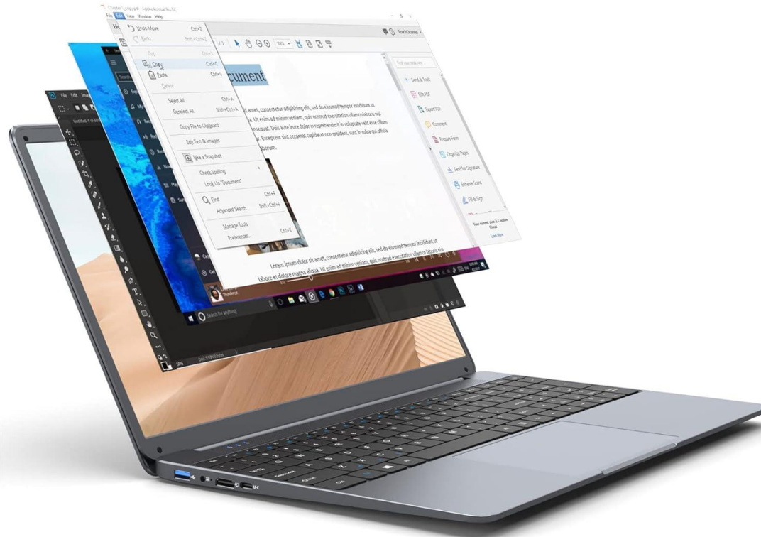
Figure 4.2: The SGIN laptop is equipped with 12GB of RAM and 512GB of SSD storage, providing ample space for applications and data.