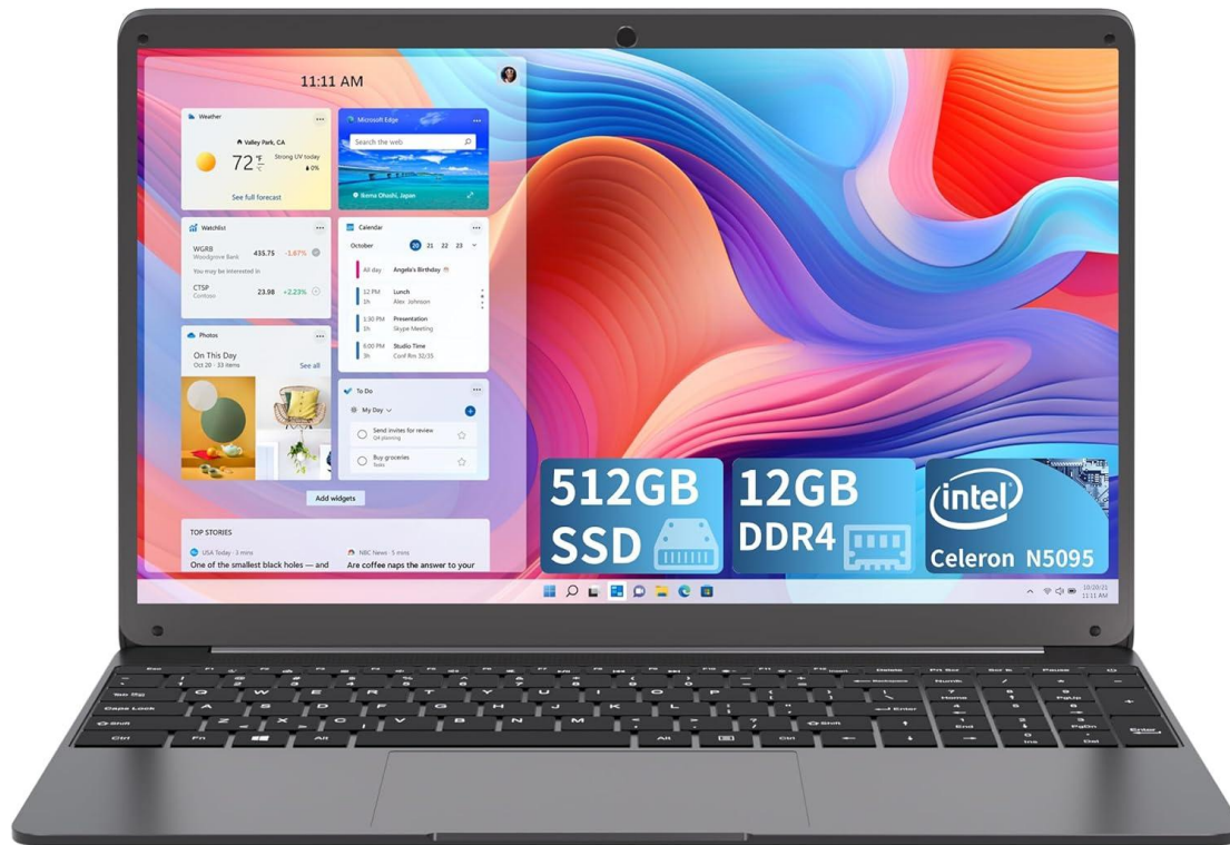
Figure 1.1: Front view of the SGIN 15.6 Inch Laptop displaying its screen and keyboard.